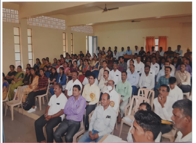
Participants of the Program