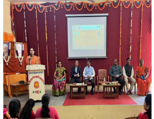
Resource person's speech on "Legal Literacy"