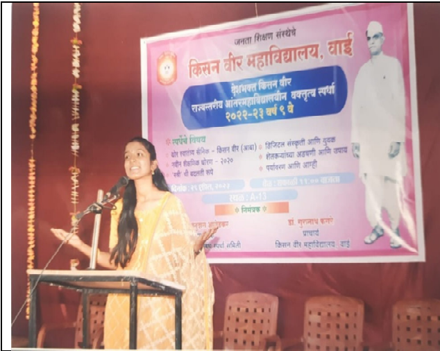
Participant delivering the Speech