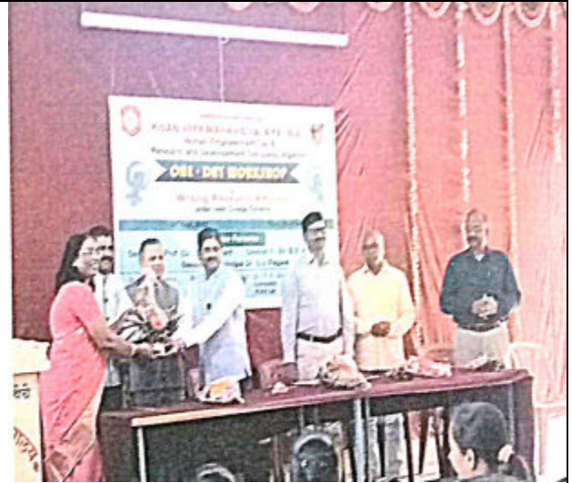
Felicitation of Hon. Principal in One Day Workshop on “Writing Research Articles”