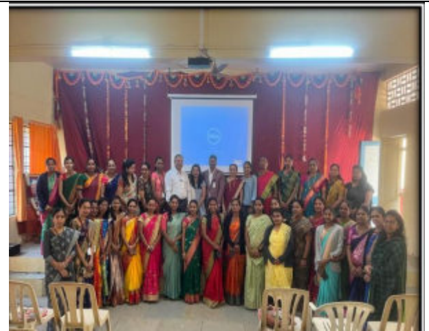
Guest Lecture on "Pre-marriage Counselling"