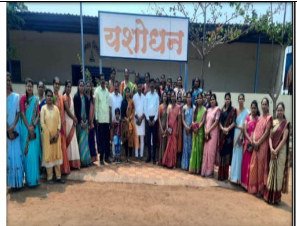
Group Photo on International Women's Day