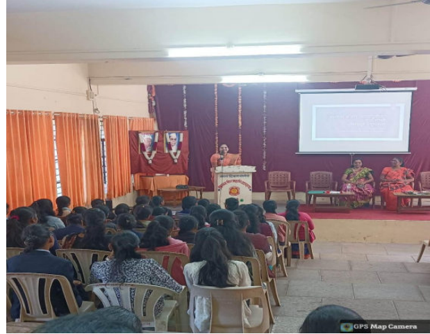
Felicitation of Guest in One Day Workshop on "Legal Literacy"