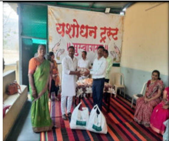
Felicitation of Chief Guest on International Women's Day