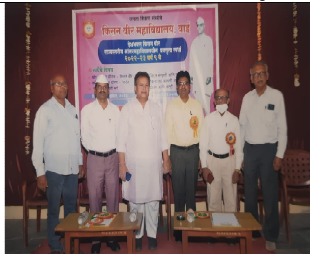
Respected Guests on the Dias